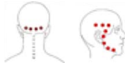
Figure 4 (Botox treatment for migraine is at the base of skull from forward head posture, temporalis/masseter muscles from bruxing and carpal tunnel from compression of cervical nerves again the result of forward head posture)

The ADA guideline parameters of treatment state that; "The dentist should consider a differential disease classifi-