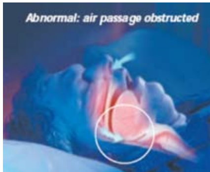
Figure 2 (Mandible and base of tongue falls back with the patient in the supine position blocking the airway)

Over 75 million Americans (25%) have sleep apnea and many more have sleep disturbances xiii . A survey of the literature demonstrates the prevalence of TM symptoms in the general population is 41% and those having a sign 56% 2 . The most frequent symptom (96%) of TM dysfunction (inflammation/capsulitis, disc displacement etc.) is right sided back of head pain (occipital cephalgia) xiv . The body assumes a forward head posture when there is inflammation in the TM joints. When the inflammation/dysfunction is corrected through decompression (day and night orthotics using the sibilant phoneme technique) there is a return of head posture by 4.43 xv inches. The forward head posture places increased stress on the cervical spine and the insertion of the muscles at the back of the neck/head (see figure 3). This forward head posture changes occlusion xvi/xvii/xviii . So it is clear why the ADA and the